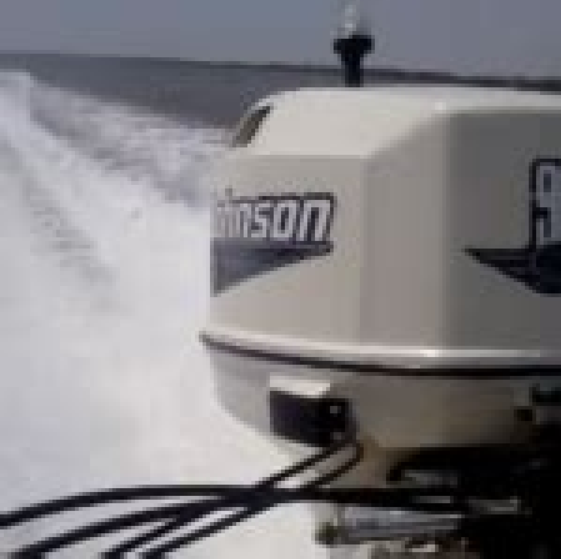
Yamaha 90hp outboard service manual pdf. Yamaha outboard customer service. Yamaha outboard first service cost. Yamaha 70 hp outboard maintenance schedule. How to service a 40hp yamaha outboard. Yamaha 90hp 2 stroke outboard service manual. 2006 yamaha 90hp outboard service manual.